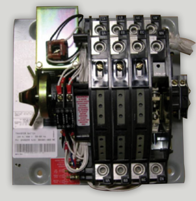
Photo left details 4-pole Transfer Switch used for switching the neutral